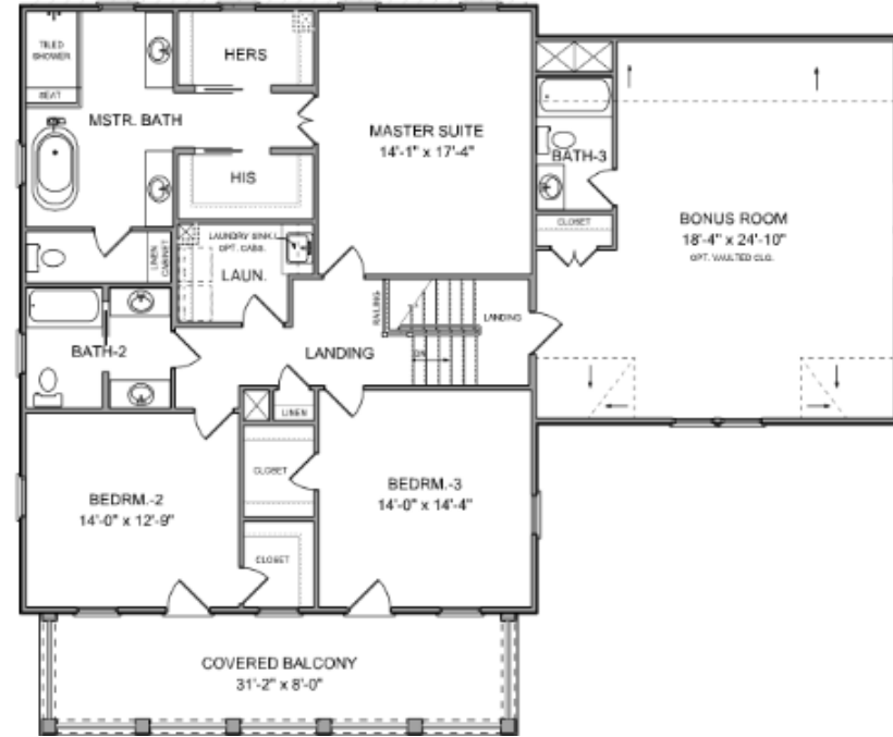
UPPER LEVEL PLAN